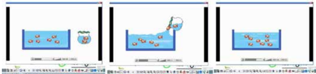
Figure 8: Problem Situation Presented through the Dynamic Electronic Lesson about Pouring the Fish in the Aquarium

2. Increase : With regard to the problem situation as the Figure 8, it described the way of pouring the fish from the glass jar in the aquarium and the fish were swimming in the aquarium. This represented the existing objects or amounts and the direction of adding the objects or the amounts to escalate the amounts or the objects.