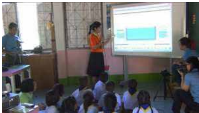
Figure 1: Presenting the Dynamic Problem Situation through the Electronic Lesson

The teacher turned on the motion of pouring the fish in an 1 aquarium to stimulate the students' interest as shown in Figures 1 and 2. All of the students said, "Wow, there are three fish here and there are two fish over there", which indicated that all students were interested in the problem that the teacher dynamically presented. They were curious to know, and needed to find out the answer. It was remarked that all students said, "All fish go around in the aquarium." Then, the teacher asked the students to count the total amount of the fish in the aquarium. (See figure 1).