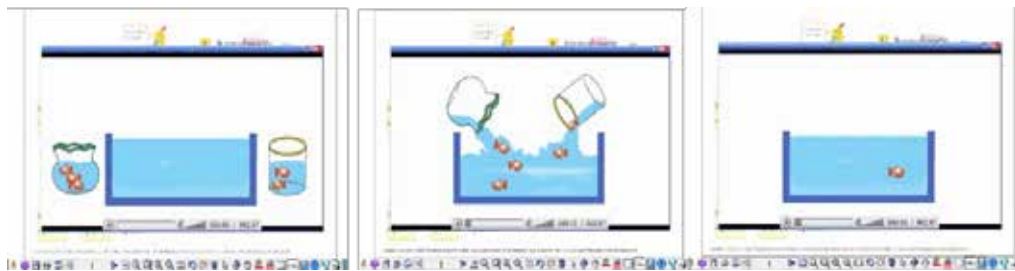
Figure 2: The Dynamic Problem Situation Presented via the Electronic Lesson about Pouring Two Glass Jars of Fish Simultaneously in the Aquarium