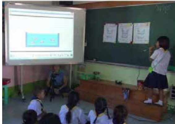
Figure 6 : Students’ Presentation and Comparative Discussion as the Whole Class

Phase 4: Summarization through connecting students’ mathematical ideas emerged in classroom